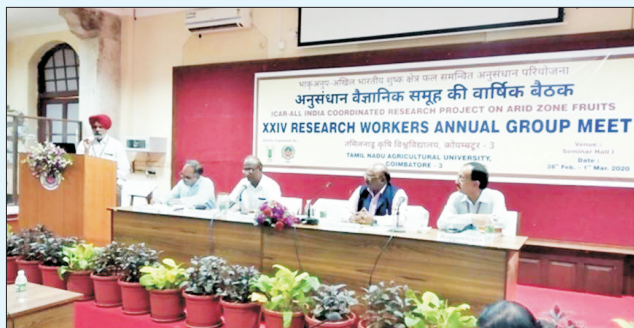
Dignitaries on dias during ARWG meeting of AICRP on AZF