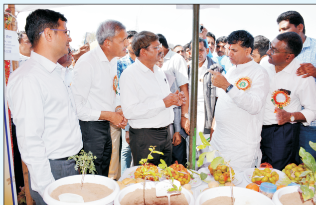
Hon'ble Union Minister of State Agriculture and Farmers' Welfare, Sh. Kailash Chaudhary visiting and discussing about technologies at exhibition stall of the Institute during the Kisan Mela organized at KVK Gudamalani, Barmer-II on 24.02.2020.