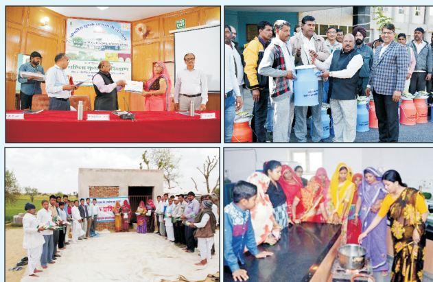
Some views of trainings and input distribution under SCSP Scheme.