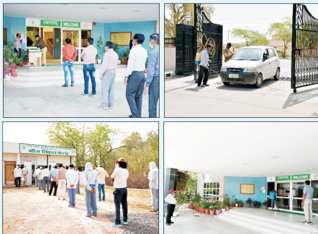
Sanitization and maintaining isolation distance, using mask, etc. by the staff of the Institute against COVID-19

sanitization of the office building, laboratories, farm complex, residential colony, farm implements. Distribution of masks and sanitizers among all staff members of the Institute including SRFs, YPs, labourer, and regular temperature checking of all employee and sanitization at the main gate of the Institute were also carried out. The actions to maintain social distance in working areas and pasting of pamphlets to create awareness about precautions to be taken against COVID-19 within and outside of the Institute, etc., were also taken care of.