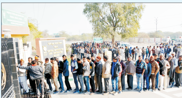
Long queue of farmers waiting to get vegetable seeds

● Celebration of seed sale/distribution day: The seed distribution day was celebrated at the Institute on 06.02.2020. In this programme, more than 1000 farmers participated from different states of the country like Rajasthan, Punjab, Haryana, Madhya Pradesh, Gujarat, etc.