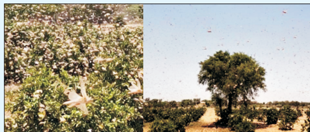
A field view of locust attack in the Institute.