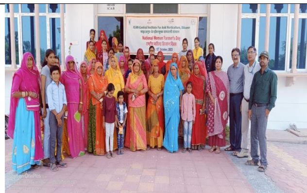
Farmer women participants during “National Women farmer’s day” on 15 th October, 2023 at ICAR-CIAH, Bikaner.